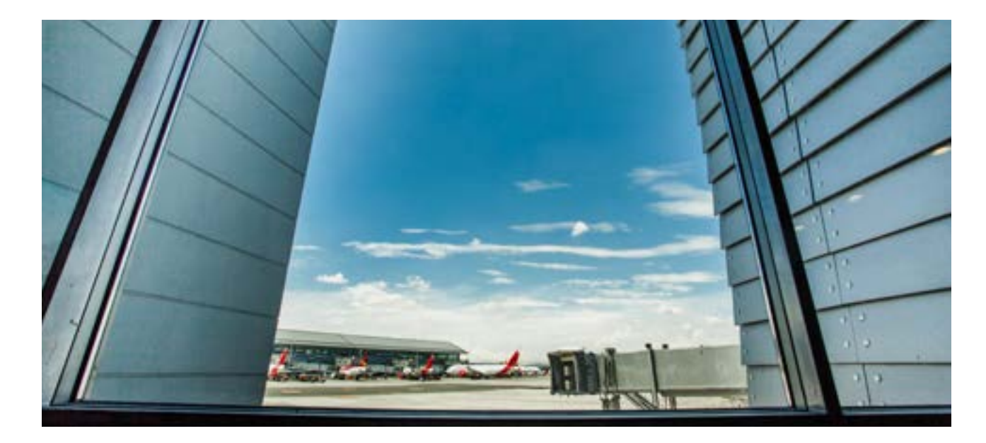
El Dorado Airport Bogota, Colombia